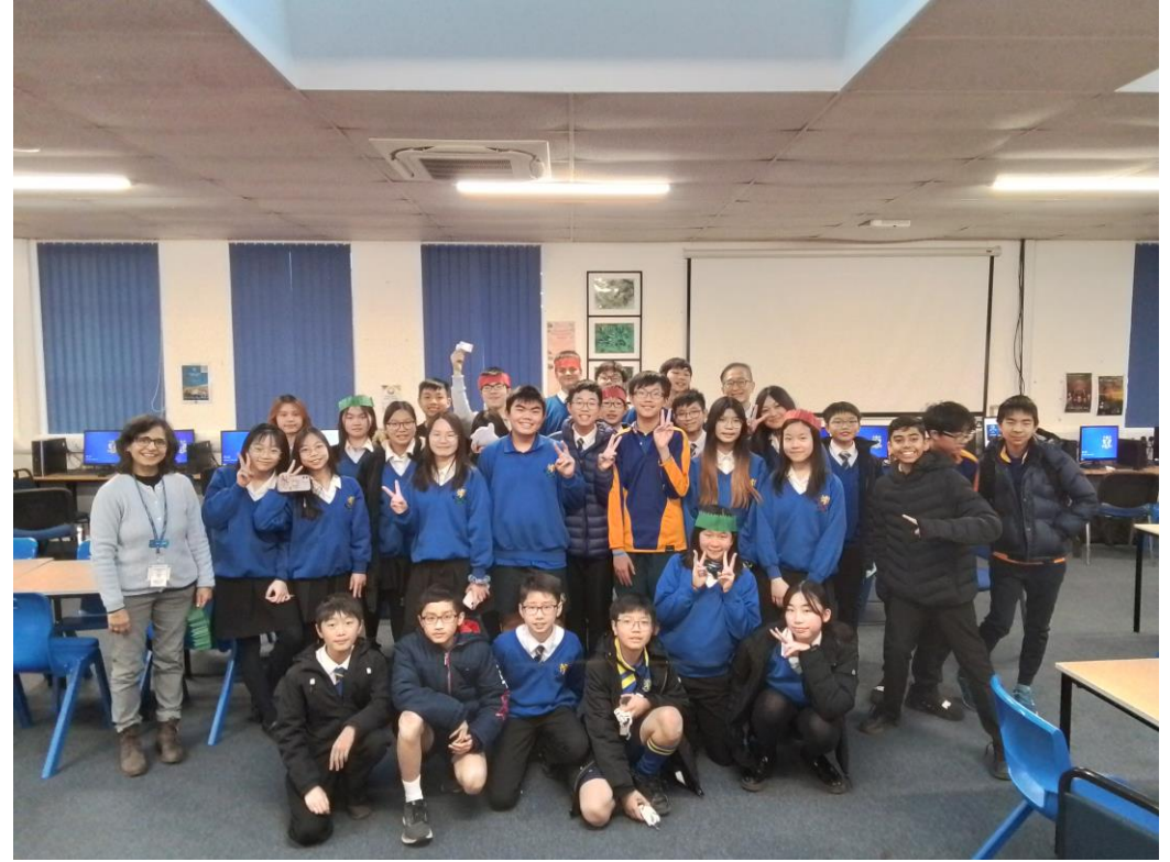
EAL Club Activities