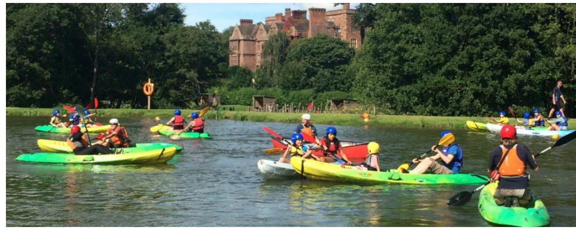
Small man made lake